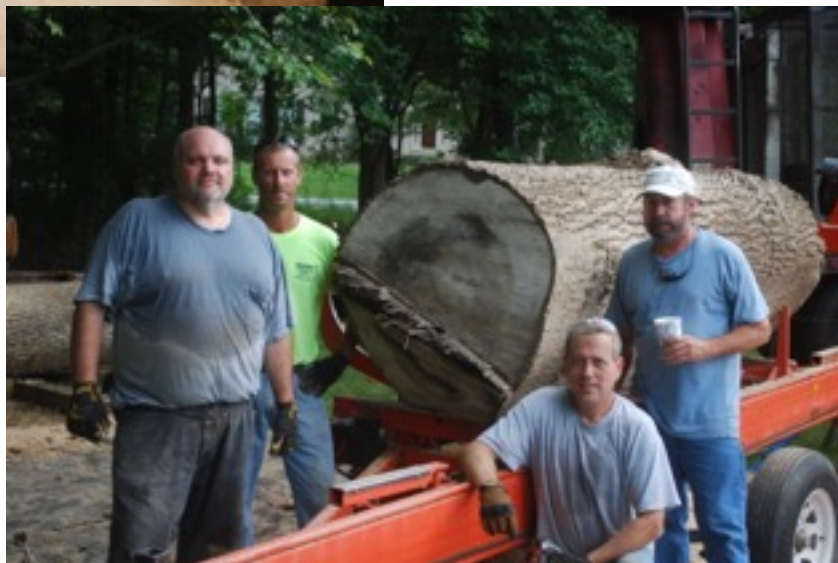
The crew, ready for the next log or 1000 board feet