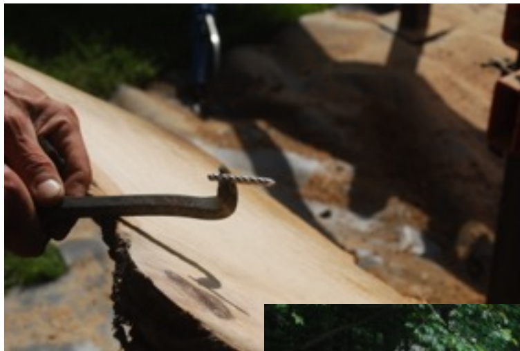
A nail, trouble!