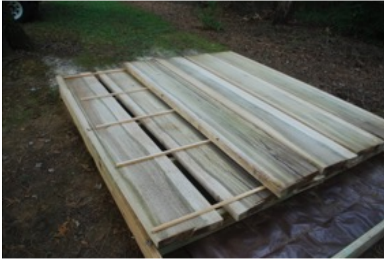
Planks, organized and protected from ground