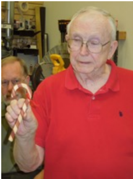
Candy canes from pencils, such a pleasure, did not record your names, sorry.